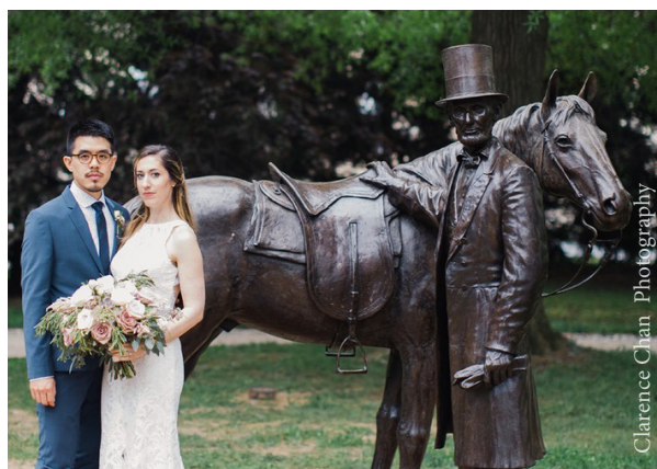
Clarence Chan Photography