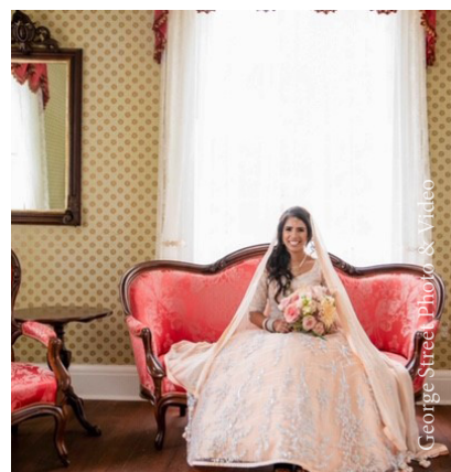
George Street Photo & Video