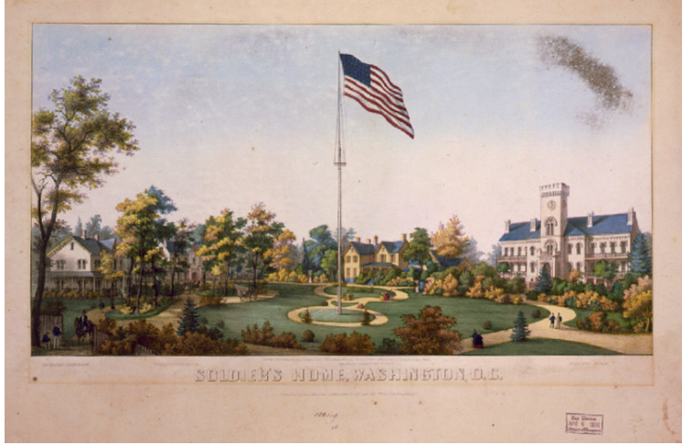
A wartime image of the Soldiers' Home (far right) and its adjacent cottages, published by popular printmaker Charles Magnus. Library of Congress.