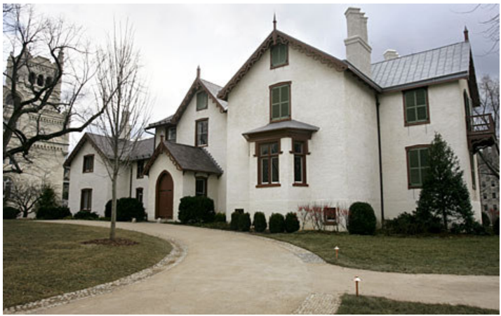
President Lincoln's Cottage, modern day.