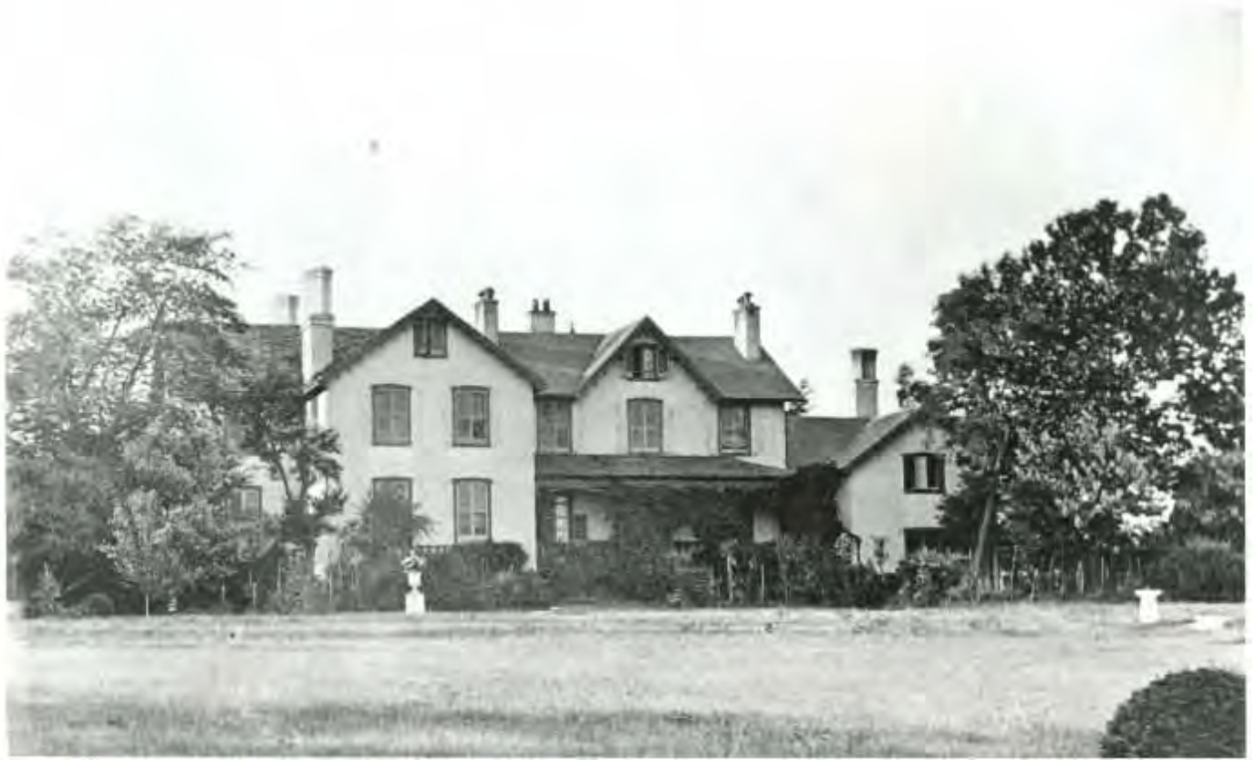
Photo of the Cottage ca. 1863, from the Todd Family album

This photograph is of President Lincoln's Cottage at the Soldiers' Home taken in the 1860s and found in a photo album belonging to one of Mary Todd Lincoln's relatives. The view is of the south side, which is the back of the cottage. The entrance doors are on the north side. The cottage was built for a wealthy banker between 1842 and 1848. In 1851 the United States government purchased the residence and surrounding property to build a home for retired and disabled soldiers. In its early years, the Home invited the President and Secretary of War to summer on the property to build political support.