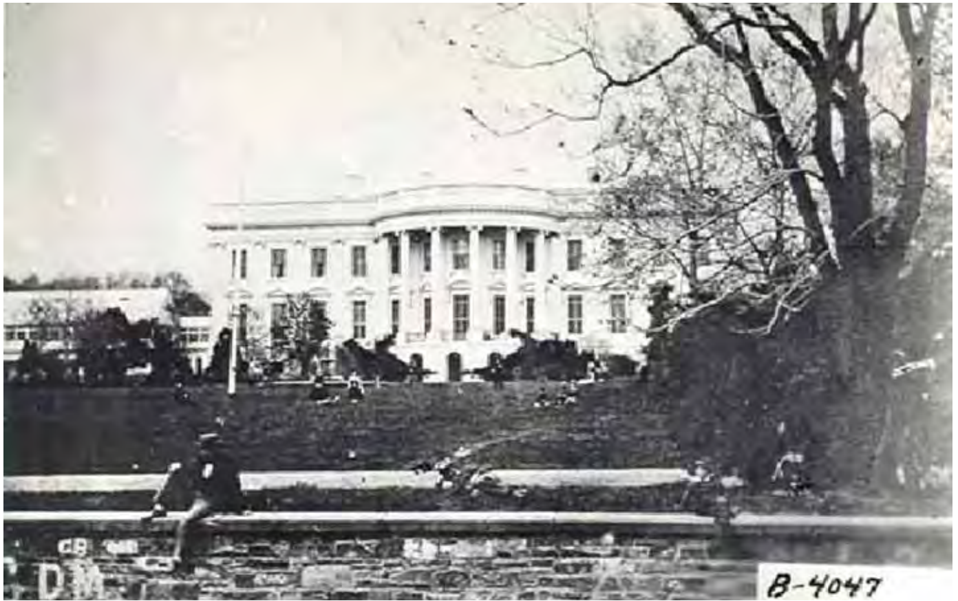
Photograph of the south side of the White House, 1861

This photograph is of the White House during the Civil War era, 1861-1865. Building began on the White House in 1792 and, although President and Mrs. John Adams moved into the residence in 1800, construction continued until 1809. When President Lincoln moved into the White House in early 1861, the building had already been rebuilt and enlarged following the War of 1812. This image shows the south side of the building, as seen from Constitution Avenue, not the view seen from Pennsylvania Avenue.