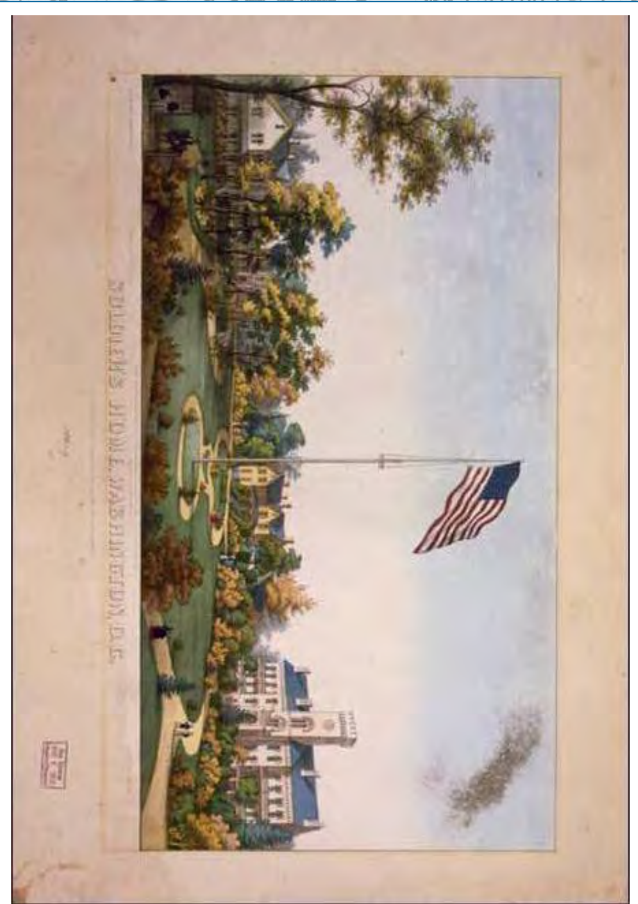
Soldiers' Home, Washington, D.C., ©Library of Congress