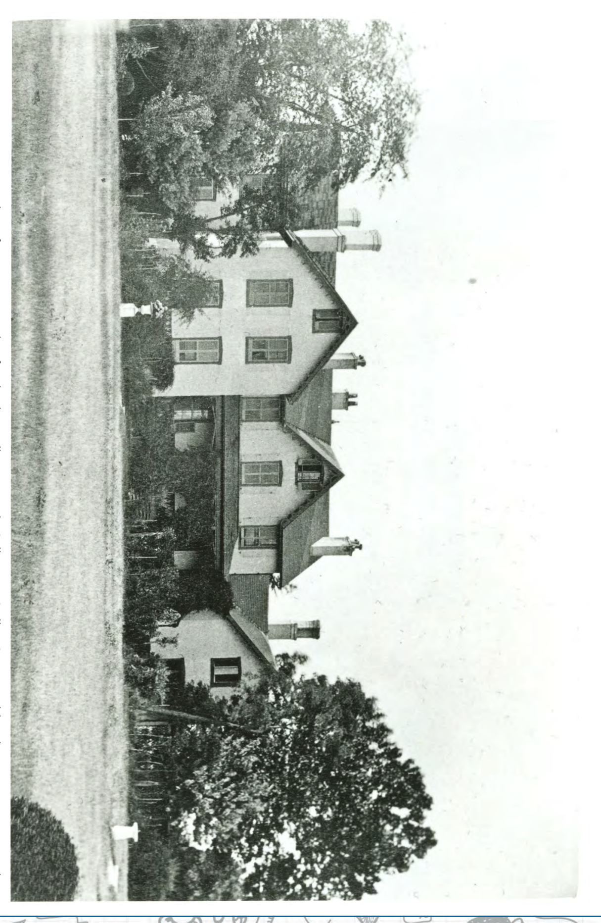
Photo from Mary Lincoln's family photo album, Lincoln Collection