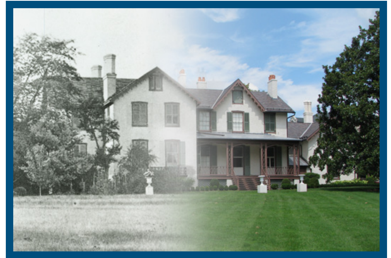
This historic photo from the Todd Family photo album is merged with a contemporary image of President Lincoln's Cottage.