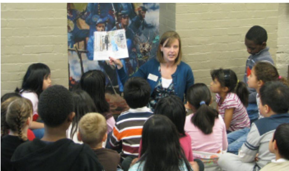
Lincoln's Hat Program Third Grade