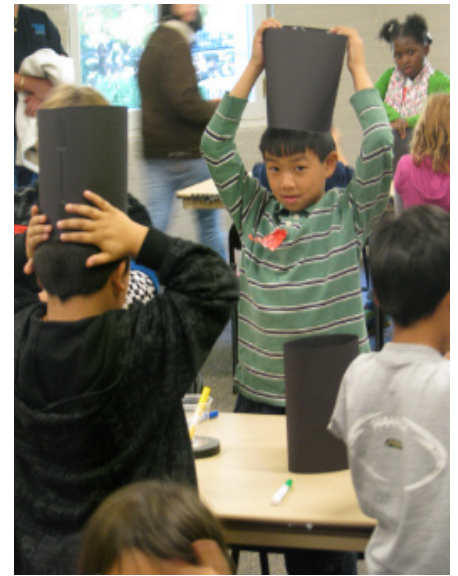
Lincoln's Hat Program Third Grade

Over the past year, President Lincoln's Cottage has established close ties to other area historic sites, including Ford's Theater, Frederick Douglass House National Historic Site, and Tudor Place Historic House and Garden. Together, these four sites