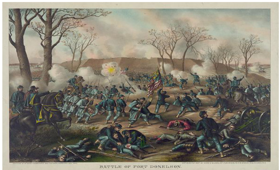
Battle of Fort Donelson, where one of Dr. Francis Lieber's sons lost an arm.