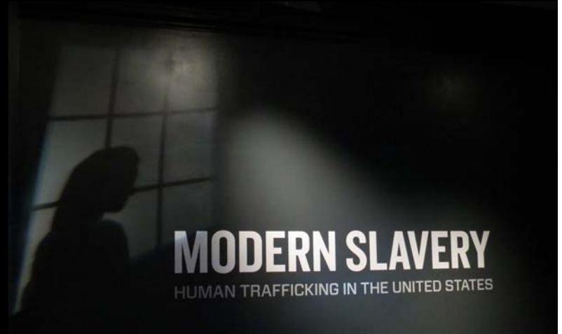
Exhibit catalogs now available in store and online

MODERN SLAVERY: HUMAN TRAFFICKING IN THE UNITED STATES