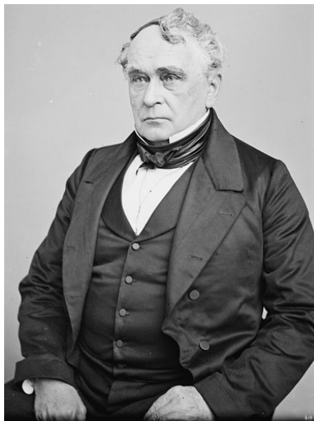
Francis Lieber.

of domestic political pressure, international pressure from neutral countries, and Confederate threats of retaliation, by the beginning of 1862 the U.S. government was, as a practical matter, extending all the international laws and customs of war to Confederate armed forces and to Southern civilians in occupied territory. This change was eased when one of the country's leading experts on the laws of war, Dr. Francis Lieber of Columbia University, advised Attorney General Edward Bates that the U.S. government could apply the international laws of war to Confederate soldiers and sailors as a humanitarian matter, without according political legitimacy to their purported government. 8 The change in policy exacerbated the problem noted earlier – few Union officers in the Civil War had any knowledge of those laws and customs.