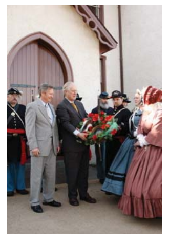
See page 3 for more photos of the Grand Opening Ceremony February 18, 2008

Tours offered on the hour Mon - Sat 10:00am-4:00pm Sunday 12:00pm - 4:00pm