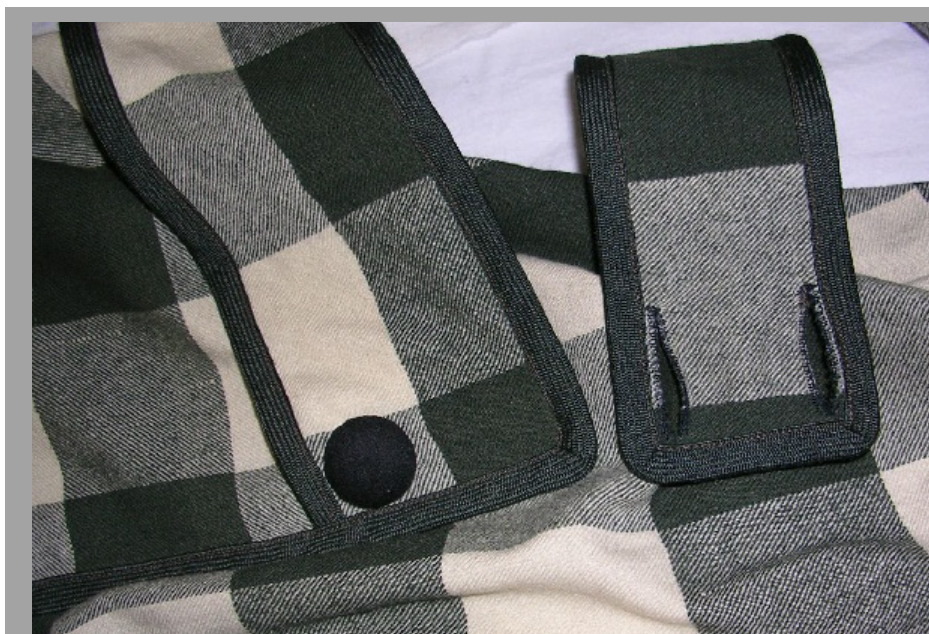
Details on Mary Lincoln's dress.

I even knew exactly Mary Lincoln's waist size — 30 inches — and that was our goal to get Sally Field's weight up to fit the size of the wrapper dress. This particular original dress was a woven check and basically what we did was print the weave on comparable wool from the north of England. The waist might have been thirty inches, but the skirt hem was a whopping 150 inches, with panels inserted. The dress was just absolutely amazing and seeing the brilliant and handstitched detail inside — the binding was black but the actual check color was a dark forest green, which gives a slight