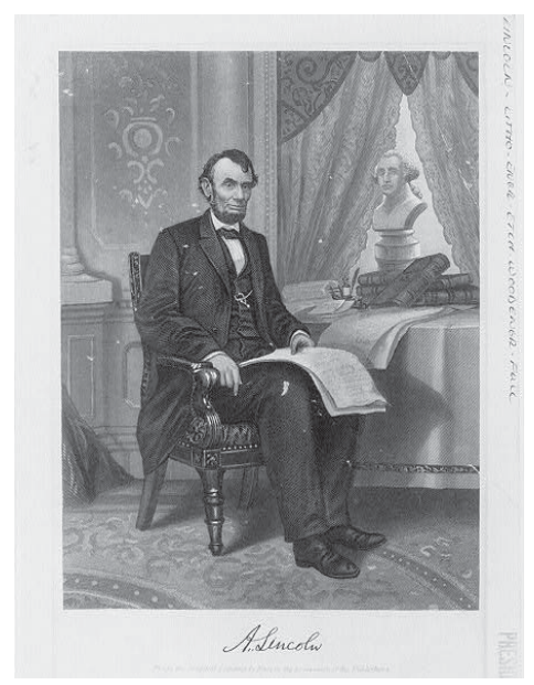
Abraham Lincoln, Pres. U.S., c1866

For us it is less important to spend our valuable tour time discussing where Lincoln might have actually